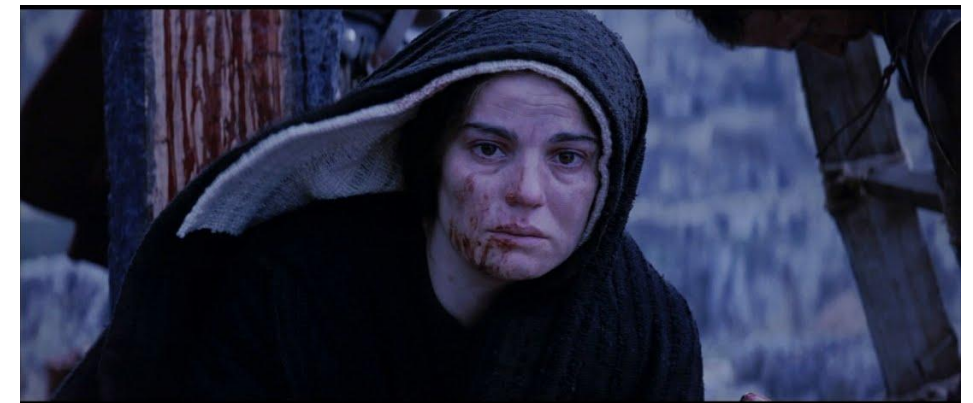
Maia Morgenstern, The Deposition ( The Passion of the Christ )